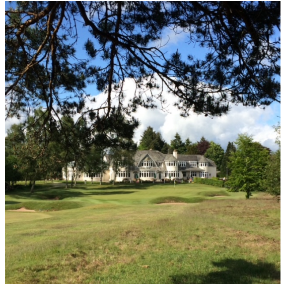
The 18 th and clubhouse at Rosemount, Blairgowrie

Down south we are again holding The Loretto School Foursomes at West Sussex . This is a very relaxed day with a round of Foursomes in the morning followed by a leisurely lunch.