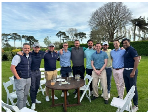
The team already looking forward to next year

Both drives were good, up the right giving a good angle into the flag. Henry played first and the ball bounced just short of the green and rolled just past the flag, almost hitting it, to about 10 feet. Uppingham then followed and to their enormous credit played an almost identical shot which finished a couple of feet short of the Loretto ball. Crucially, it also meant that they would get a read from Brodie's putt. The putts weren't easy as they were sharply downhill with a bit of break. Brodie's hit the hole at perhaps a fraction too much pace and lipped out leaving Uppingham to hole for the win and the overall match. Impressively they did.