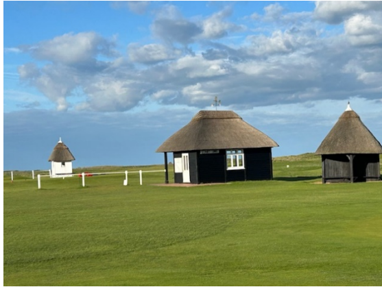
The first tee at Royal St. George's

probably Tonbridge just in order to get to the semi-final!