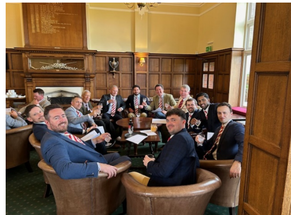
The team warming up with kummells in the Royal St. George's Clubhouse

Loretto's week started with the now traditional lunch at Royal St. George's on the Tuesday where we celebrated the incredible feat of winning three tournaments in a row.